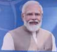
Shri Narendra Modi Prime Minister of India