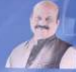
Shri Bhaishri S. Sawant Union Minister of Karnataka

From 12-16 January 2023, Hubballi-Dharwad Viksit Yuva Viksit Bharat